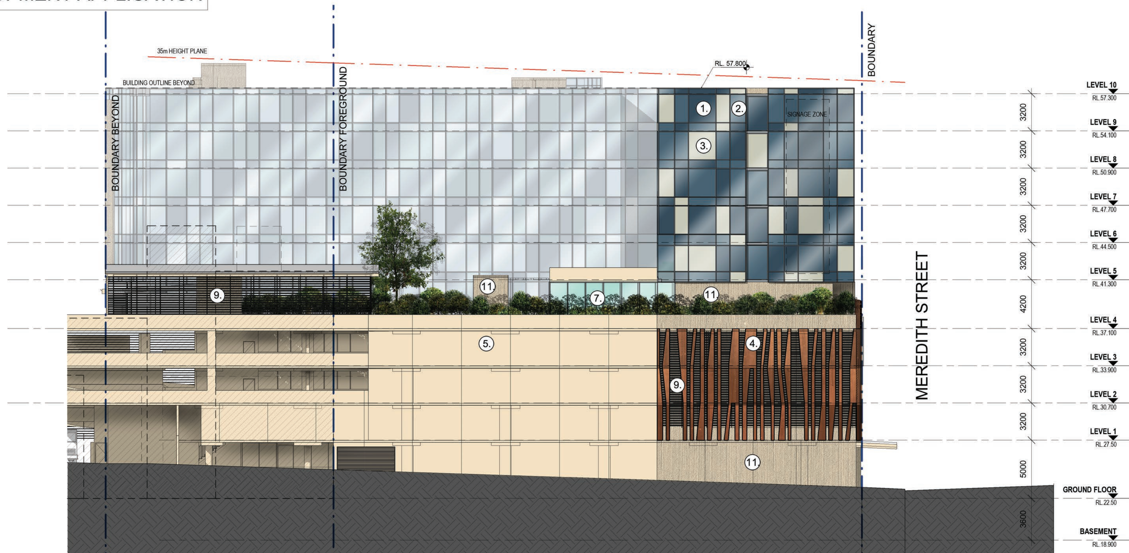
2 NORTH ELEVATION Scale: 1:200